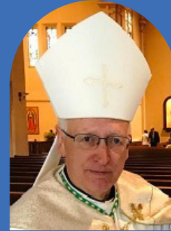
Bishop Boyea Episcopal Advisor

Demand for ethical medical education is extremely high. The school should receive in excess of 5,000 applications per year for 150 available spaces.