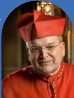
Cardinal Burke Episcopal Advisor

"Catholic Healthcare International represents one of the most important works of the Church in our time, namely to foster healthcare after the example of our Lord Jesus Christ."