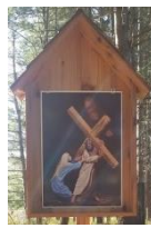
Print on Trail $10,000