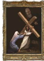
Stations of the Cross Original Canvas $40,000