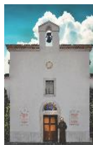
Adoration Chapel Sponsor $1 Million