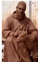
St. Pio Statue Sponsor $100,000