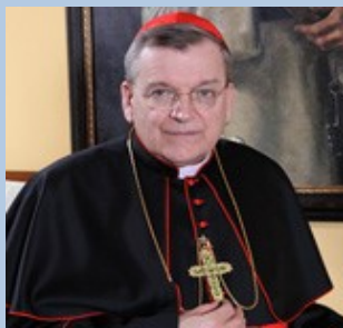
Cardinal Raymond Burke —Episcopal Moderator of CHI —Patron of the Sovereign Military Order of Malta