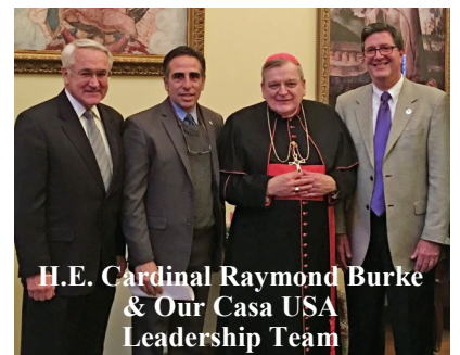
H.E. Cardinal Raymond Burke & Our Casa USA Leadership Team